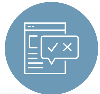
Online Survey and Engagement Tools